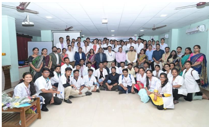
Comnclave Idea Presentation