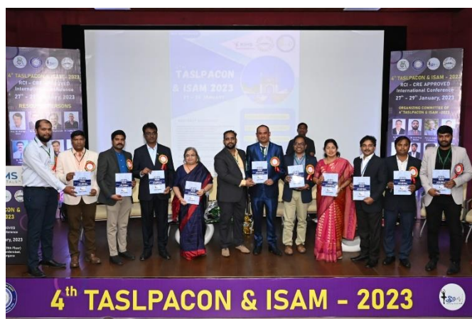
Journal Release Ceremony