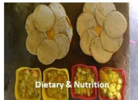
Dietary & Nutrition